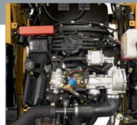
Increased fuel efficiency, low emissions

The 4.3LV6 engine works in the toughest conditions, while offering excellent fuel economy and low noise and vibration levels.