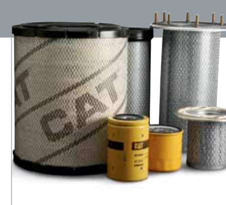
Genuine Cat Lift Truck OEM parts

When you buy from your local dealer, you can be assured that your OEM part is manufactured to meet original equipment criteria. Additionally, all Cat lift truck OEM parts come with a six-month, unlimited-hours warranty.