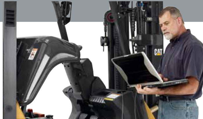
Keeping you covered

We deliver peace of mind by helping your trucks stay on the job, day after day. Every new Cat lift truck is covered by a 1-year/2,000 hours warranty that includes parts and labor, as well as components and systems. With our standard 2-year/4,000 hours extended powertrain warranty, you'll have the confidence that only comes from owning a Cat lift truck.