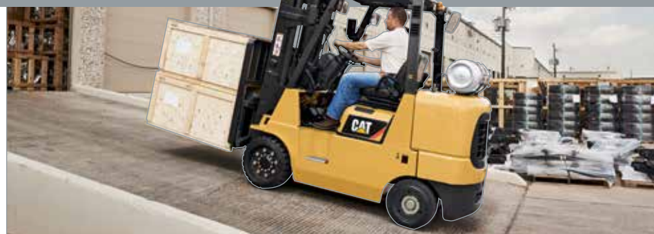
Solutions for your application

Options such as enclosed alternators, torque converter filter and specialty tires can customize the truck for your application's specific needs, while also extending equipment service life and minimizing product damage.