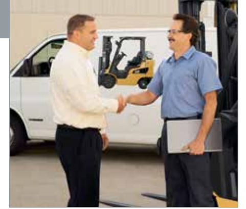
Custom financing packages

Financing your next Cat lift truck is easy with our wide range of flexible leasing and purchasing options. Whether you want to finance or lease, your local Cat lift truck dealer can help customize a package tailored to your specific needs.