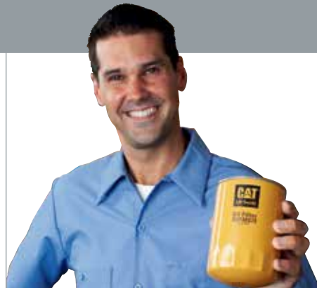
Professionals you can depend on

With hundreds of dealer locations throughout North and South America, Cat lift truck dealers provide more than lift trucks. From flexible financing options, to parts, service and product support, our dealers are unsurpassed.