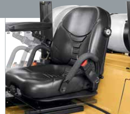
Adjustable seating for increased comfort

Operators of varying sizes can work long shifts comfortably in the standard full-suspension seat. For high-shuttle applications, an optional reverse drive configuration with swivel seat and a rear grab handle with horn button are also available.