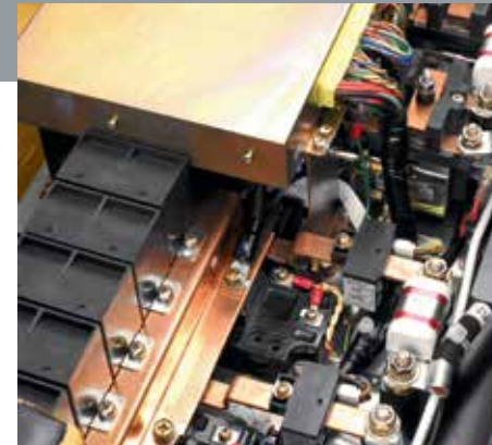
Parts when you need them

The Parts Fast Or Parts Free Guarantee ensures next-business-day delivery of all Cat lift truck parts, or they're free, including freight. If your part doesn't come in by the next business day, we pay for it.