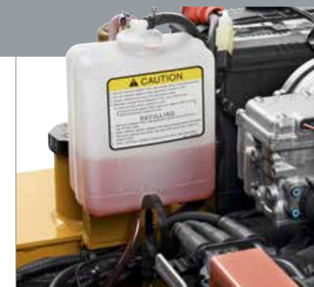
Protecting your investment

The Engine Protection System (EPS) monitors the engine oil pressure, transmission temperature and coolant temperature. The lift truck will slow down or shut off if this system recognizes abnormal conditions.